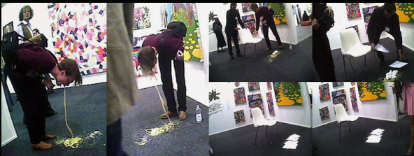
ART FORUM ACCIDENT (2005)