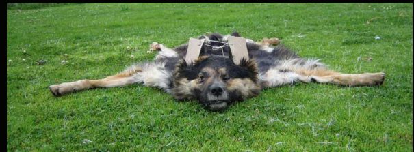
DOG CARPETS (2007)