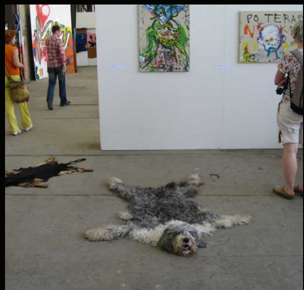
DOG CARPETS (2007)