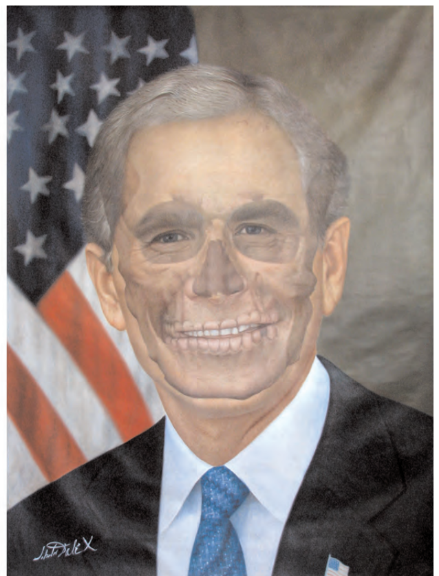
Bush Junior & Bush Senior, diptych, oil on canvas, 160 cm X 210 cm.