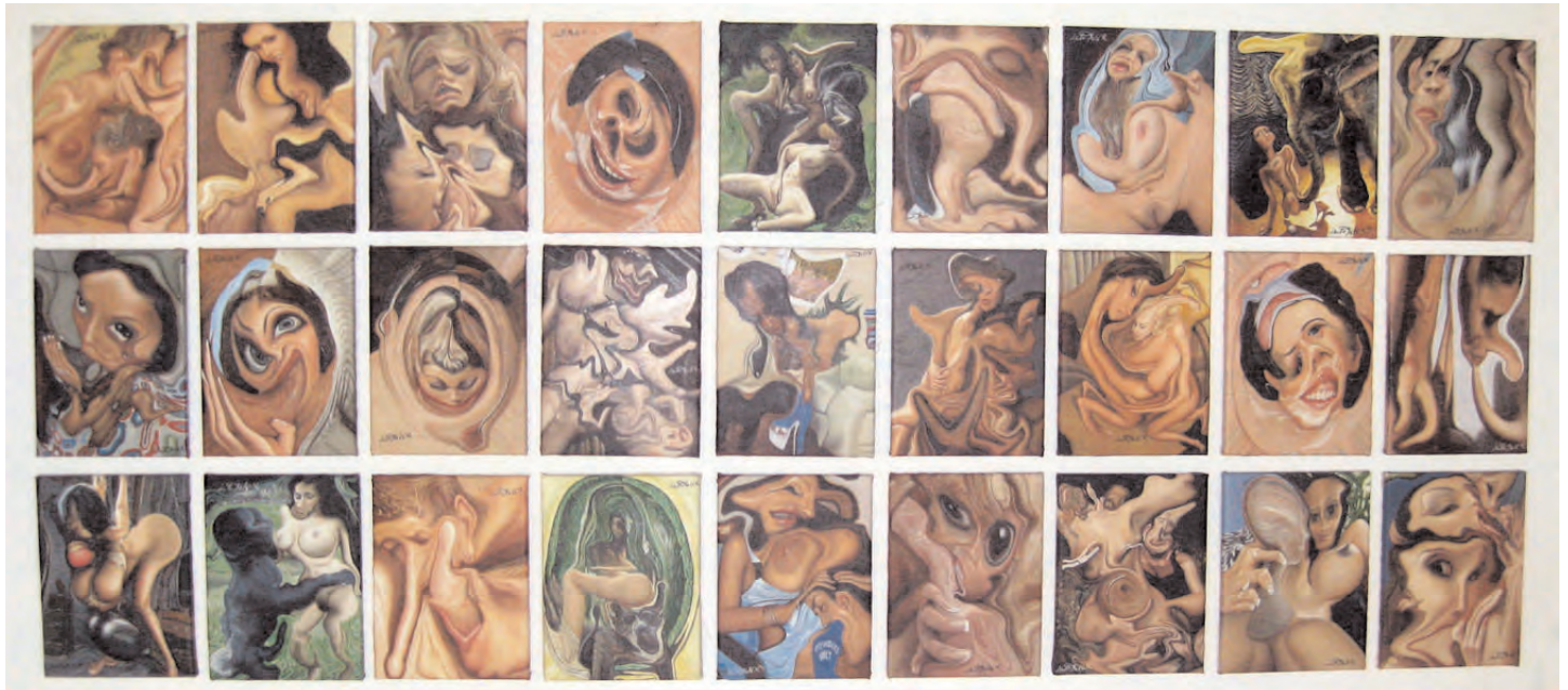
Installation of 30 Salvador DaliX erotic paintings, oil on canvas, 30 cm X 40 cm each.

The Salvador DaliX paintings are mainly based on pornographic and some political photographs stolen from the internet, then manipulated with the computer and finally painted by 'my assistants' in China: commercial painting companies who specialize in reproducing any picture you e-mail them. All the paintings are 'original' oil on canvas – handmade of course. It seems that the 'Made in China' stamp devaluates the commercial value of the paintings even more than the fact that they were painted by (a poor artists) assistants. At the same time many people admire paintings of famous contemporary artists that are produced by chinese, russian or eastern european assistants who paint for 10 US dollars an hour in New York, Berlin and London. The Salvador DaliX paintings refer to many contradictions and problematic aspects (conceptual, economical, political and visual) that I find interesting.